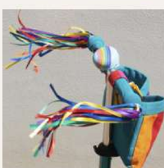
Beep Bike & Scooter Accessories