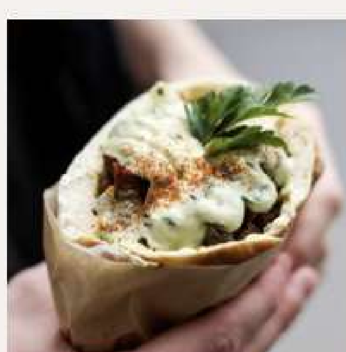
Hamsa Hummus Bar