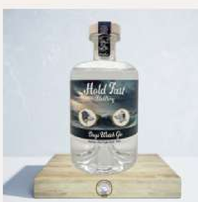
Hold Fast Distillery

With 250+ stalls set up for you, our October market lets you shop 'til you're through. From cards and candles, to clothing and cheese, check out our Line Up and shop with ease. If you're not keen on clicking above, then here are 6 of them we think you'll love: