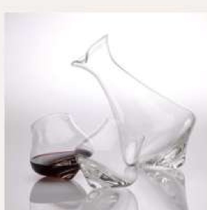
Glass By Emma Klau