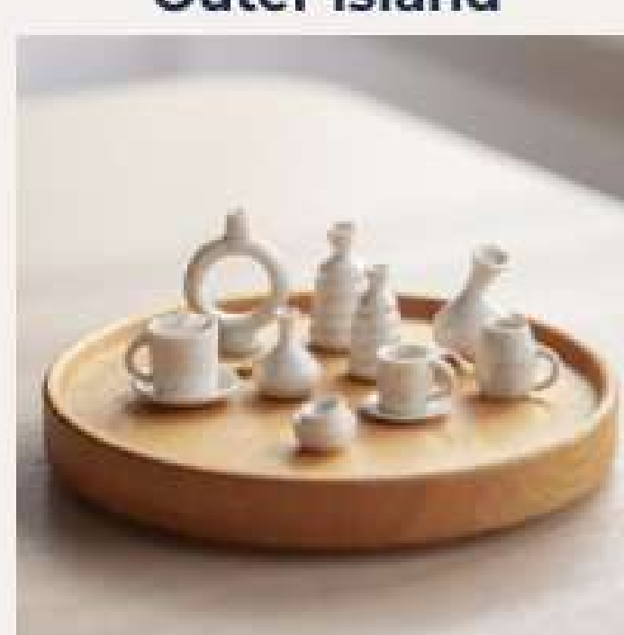
Tiny Pots Melbourne

Let's not forget the new kids on the block — here are 3 new brands that really do rock: